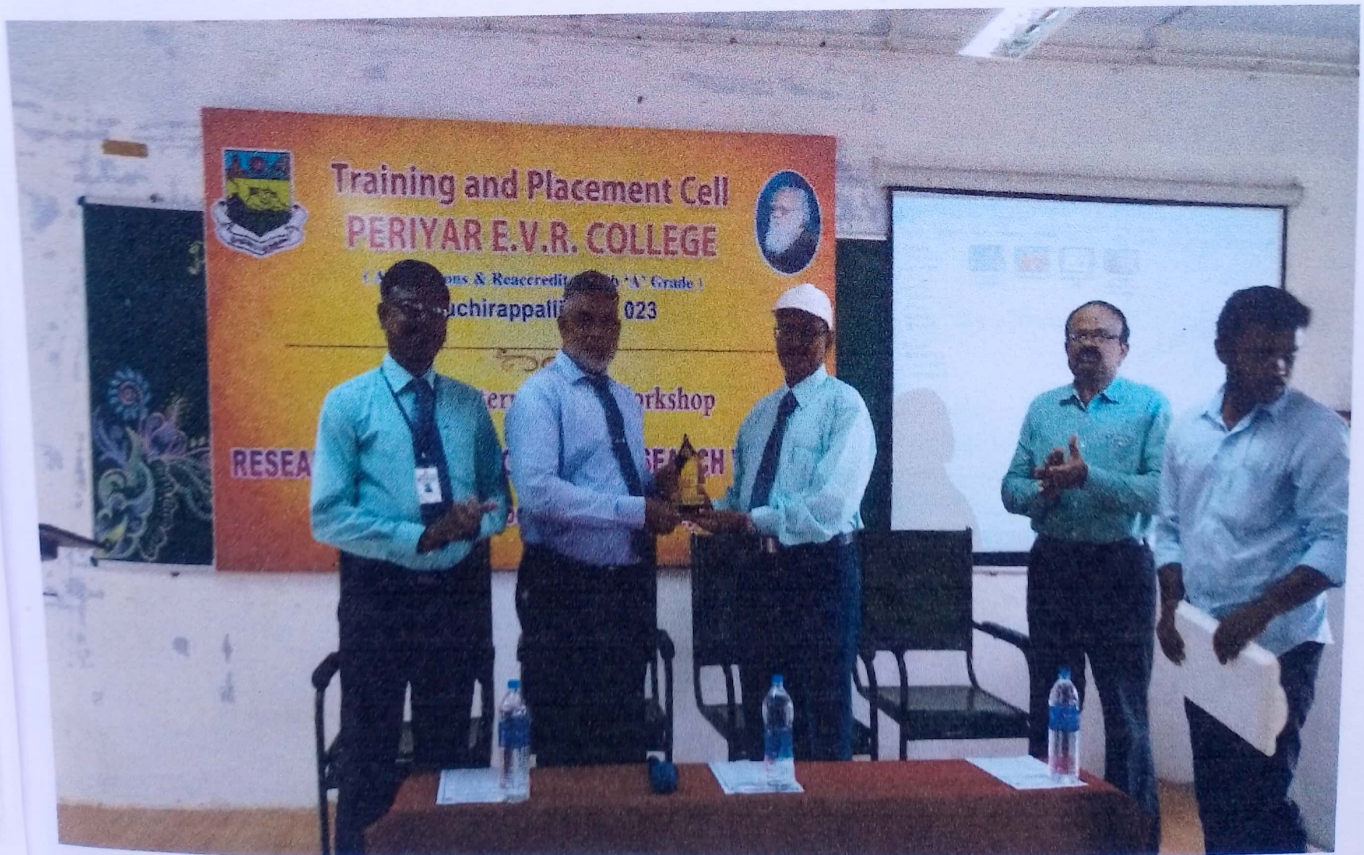
Honouring the Guest