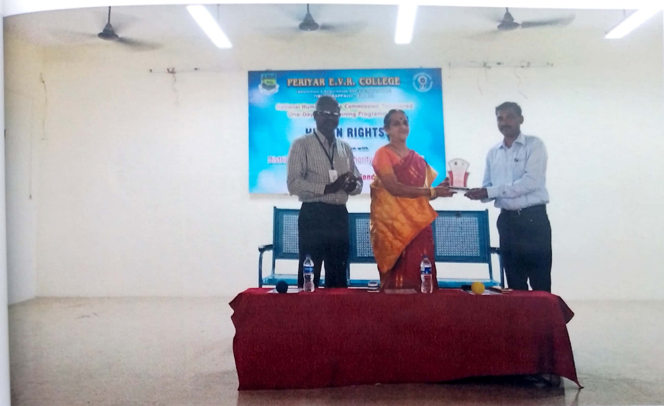
Presenting Memento to Chief Guest