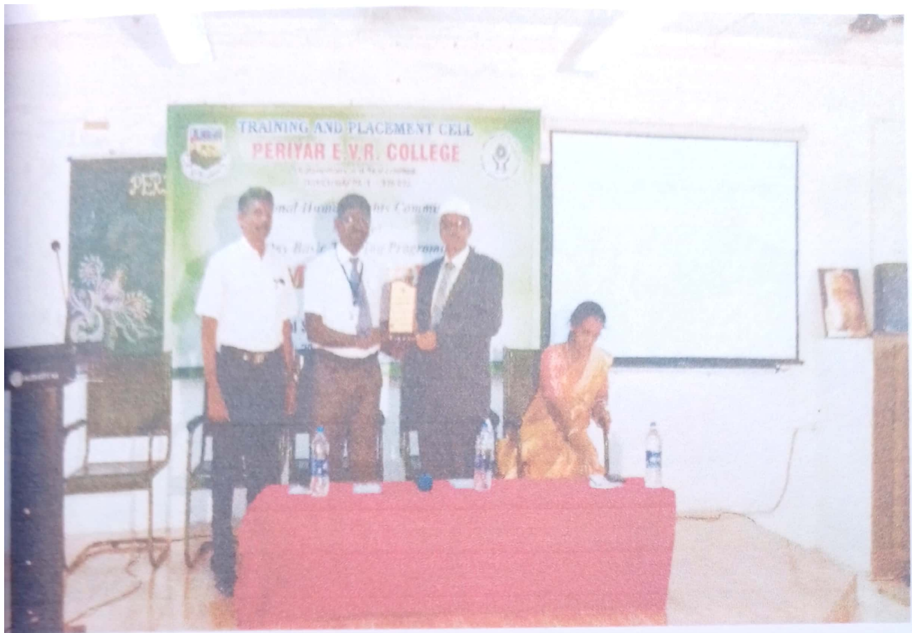
Presenting Memento to Chief Guest